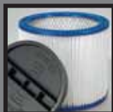
HEPA filtration for fine dust and particles