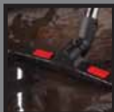
Wet pick up