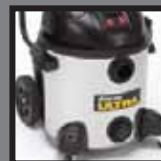
Rugged stainless steel tank