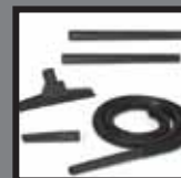
Accessories for wet/dry messes