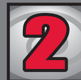
2 year warranty