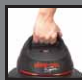
Top carry handle