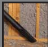
Dry pick up