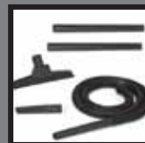
Accessories for wet/dry messes