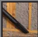
Dry pick up