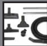
Accessories for wet/dry messes