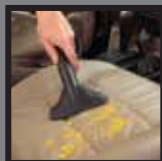
Dry pick up