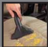
Dry pick up