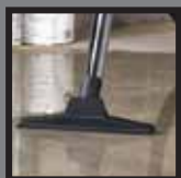
Wet pick up