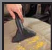
Dry pick up