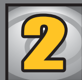
2 year warranty