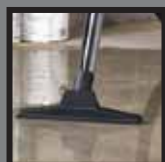
Wet pick up