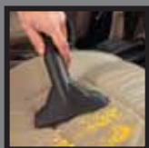
Dry pick up