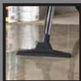
Wet pick up