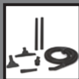
Accessories for wet/dry messes