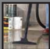
Wet pick up