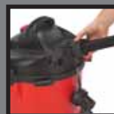
Convertible blower port