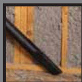
Dry pick up